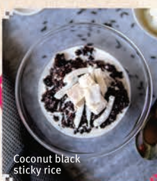
Coconut Black sticky rice

LORD CHONG (ลอดช่อง) .....$9.90 Lord Chong cendol, jackfruit, toddy palm, young coconut meat in coconut syrup.