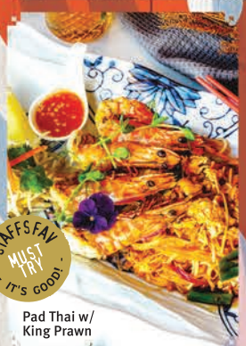
Pad Thai w/ King Prawn