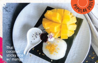
Thai coconut sticky rice w/ mango