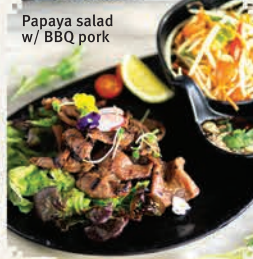
Papaya salad w/ BBQ pork