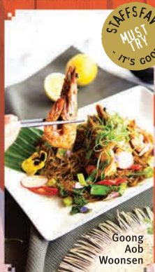
Goong Aob Woonsen