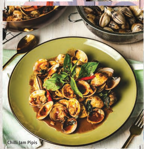
Chilli Jam Papis

STEAMED whole BARRAMUNDI with CHILLI & LIME 🌶️.....$42.90