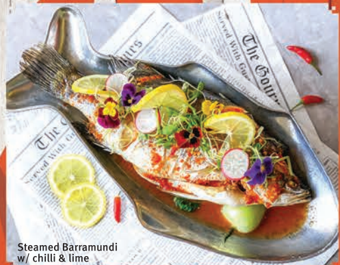
Steamed Barramundi w/ chilli & lime