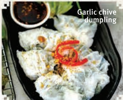
Garlic chive dumpling