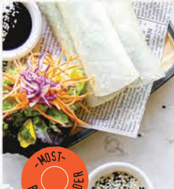
MOST POPULAR ORDER