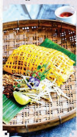
Gra Prao Gai