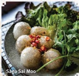
Sago Sai Moo