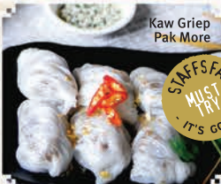
Kaw Griep Pak More