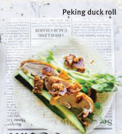
Peking duck roll