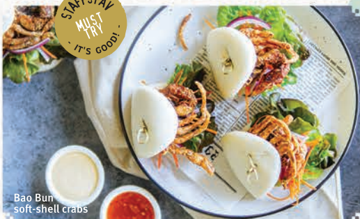
Bao Bun soft-shell crabs

LARGE $29.90 Mussel, fish, squid and king prawn served in spicy-sour Thai soup.