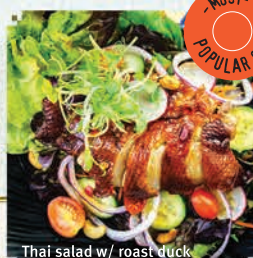
Thai salad w/ roast duck